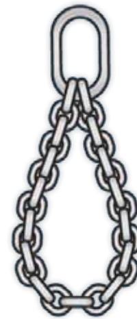
Single Endless Basket

Listed Working Load Limits apply only to normal conditions of use in straight configurations with equally loaded legs. For endless slings, WLL's of 75% of above-listed WLL's for the corresponding double leg sling are recommended.